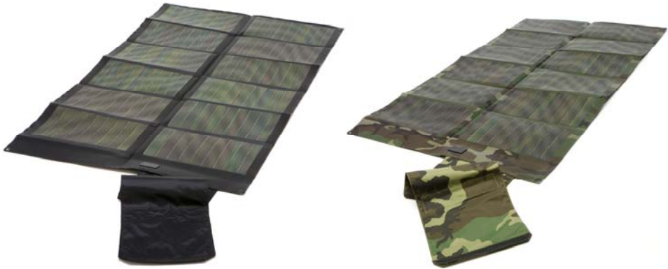
P3-62W unfolded in Black and Woodland